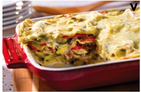
VEGETABLE LASAGNA Deep Dish 55. 00 8 pcs. Full Med. 95. 00 16 pcs.