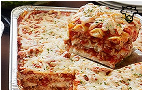
CLASSIC MEAT LASAGNA Deep Dish 55. 00 8 pcs. Full Med. 95. 00 16 pcs.

From our recipe box to your table. We have been making these scrumptious dishes for over 2 decades!