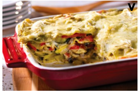
VEGETABLE LASAGNA Deep Dish 55. 00 8 pcs. Full Med. 95. 00 16 pcs.